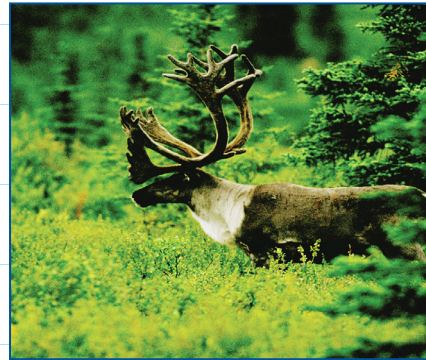
Woodland caribou and many other wildlife species require more ecologically sound and protective forest practices.

SINCE THE RELEASE OF OUR FIRST SCORECARD IN 2007, SOME OF THE WORLD'S BIGGEST STORES HAVE MADE HUGE ENVIRONMENTAL PROGRESS.