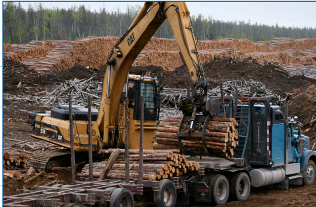
To be environmentally responsible, office products companies first need to know where each paper product comes from, and if those sources involve Endangered Forests and other controversial and unsustainable practices.

ENDANGERED FORESTS: The world's last remaining intact forest landscapes, imperiled species' habitats, old growth ecosystems, rare forest types, and other high conservation value forests need to be protected from logging—not turned into paper products. Office products companies need to avoid such products, and phase out Endangered Forest suppliers that may already be in their supply chains.